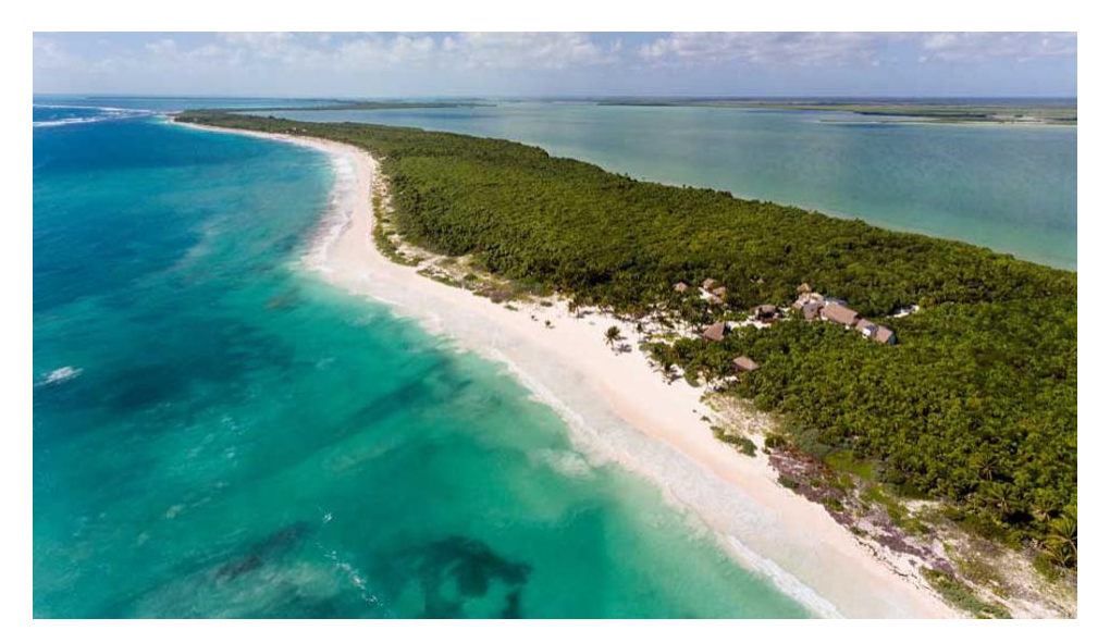
The location for Casa Chablé