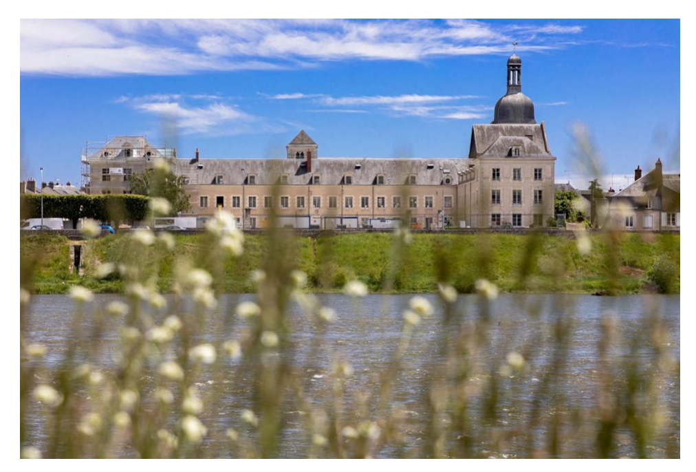
Fleur de Loire