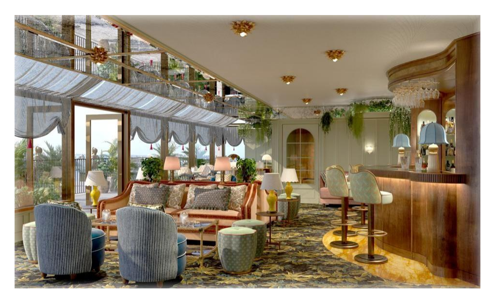
Gleneagles Townhouse