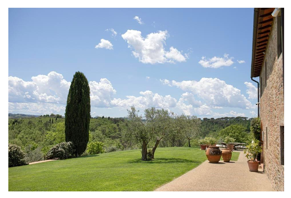
Agriturismo Casetta