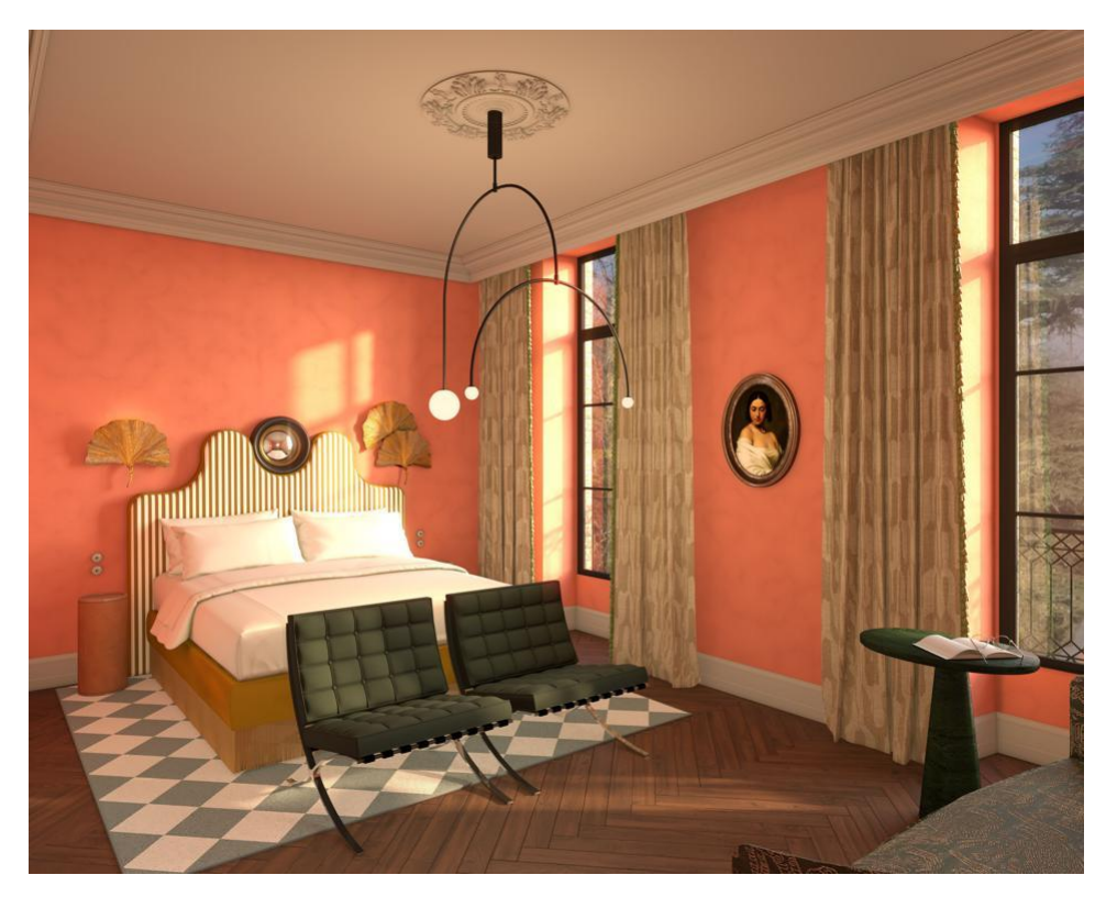
Revivo Château de Fiac