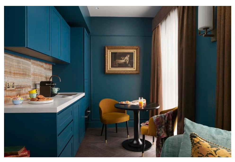
The Other House