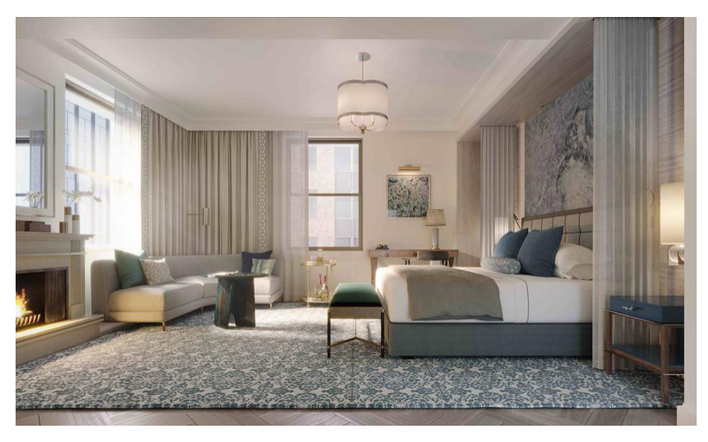
A rendering of the Wall Street Hotel

Further cementing the Catskills' status as a smart getaway from New York City, the new Chatwal Lodge is nestled within the gates of the Chapin Estate, with elegant details that seem to have been carved straight from the woods in which it stands. There will be farm to table cuisine and an impressive spa.