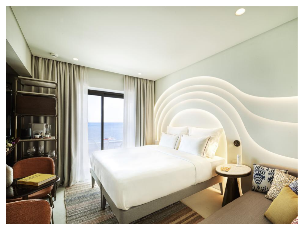
A bedroom at Brown Beach House Corinthia