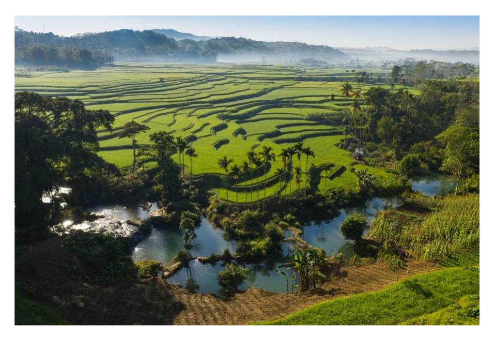
Sumba, the setting for Cap Karoso