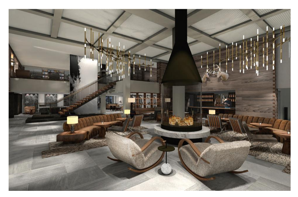
A rendering of the Hythe