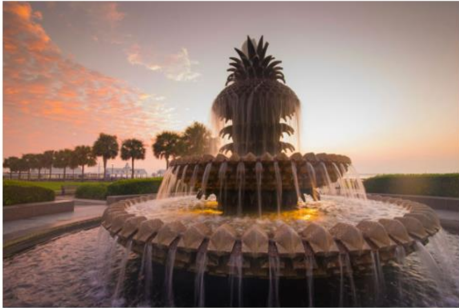
FRENCH QUARTER INN