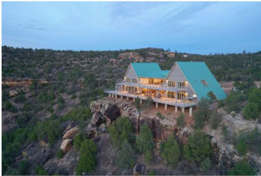
CANYON MADNESS RANCH