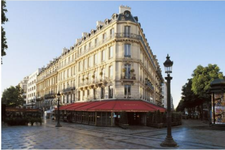
HOTEL BARRIÈRE LE FOUQUET'S