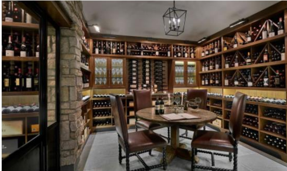
DEER PATH INN