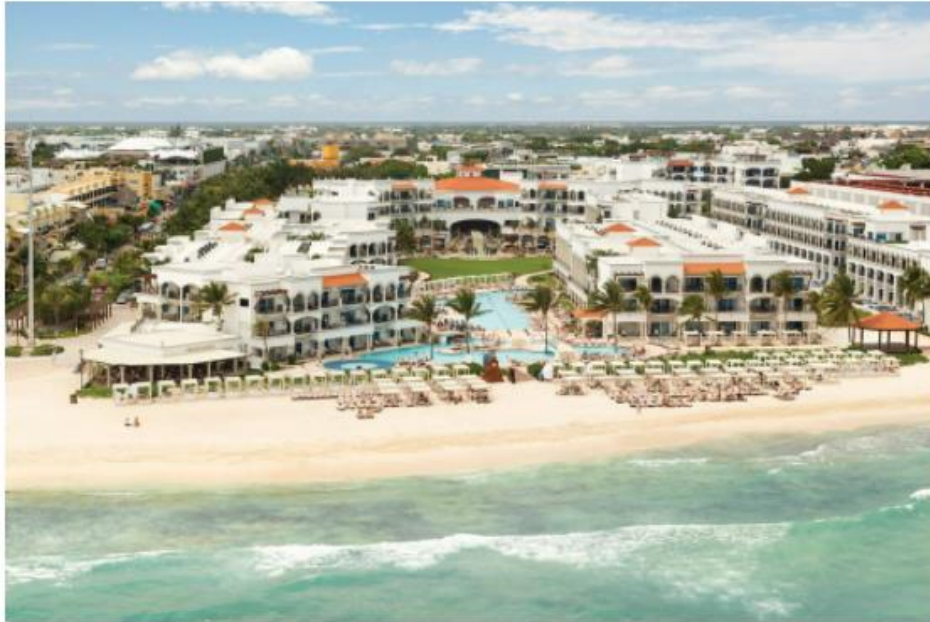
HILTON PLAYA DEL CARMEN