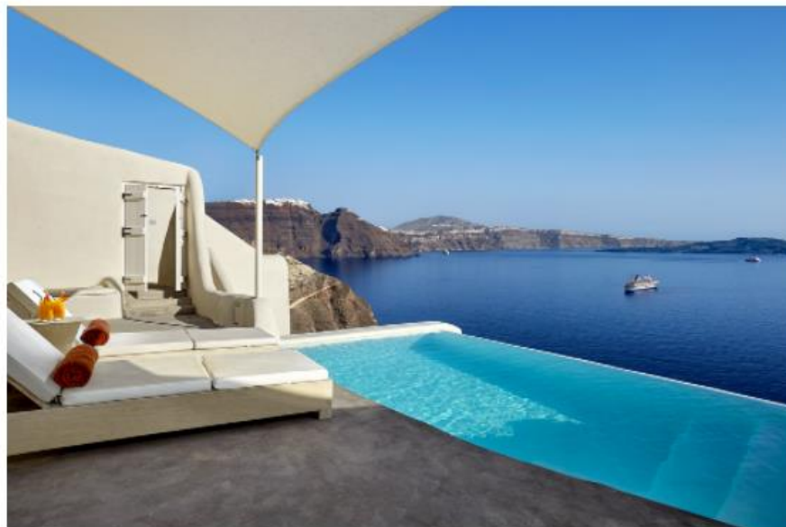
MYSTIQUE HOTEL SANTORINI