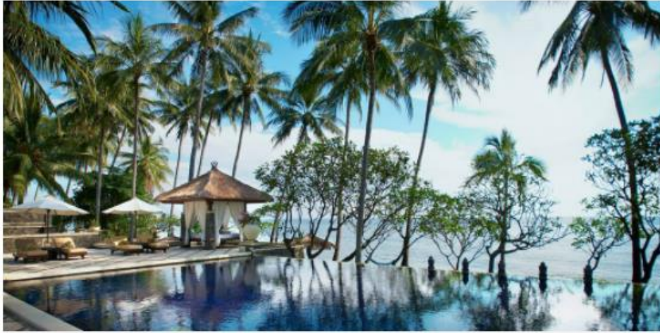
SPA VILLAGE RESORT