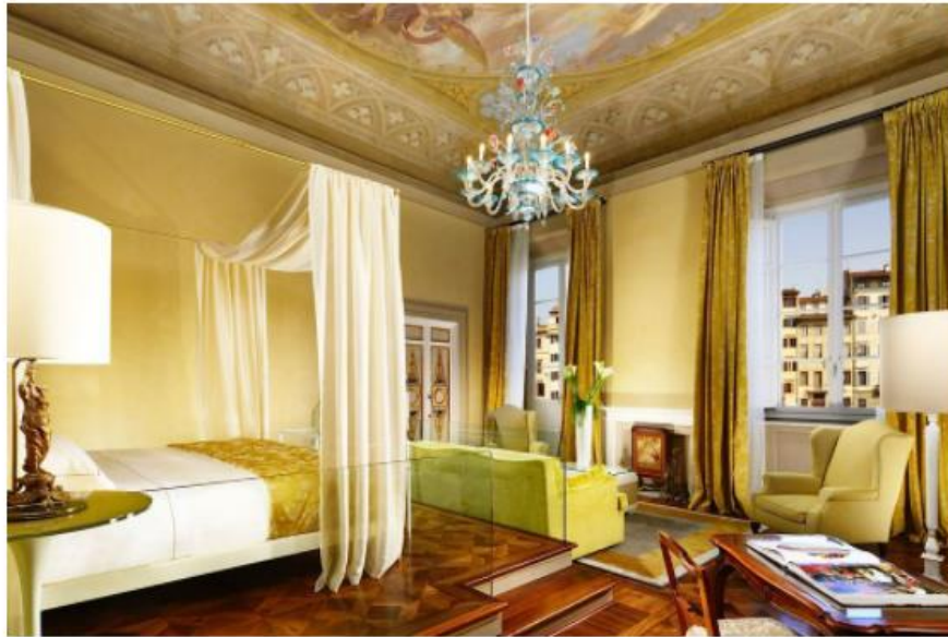
GRAND HOTEL MINERVA