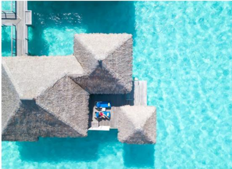
TRUE TAHITI VACATION

Location: St. Regis Bora Bora , the filming location of the actual movie Couple's Retreat