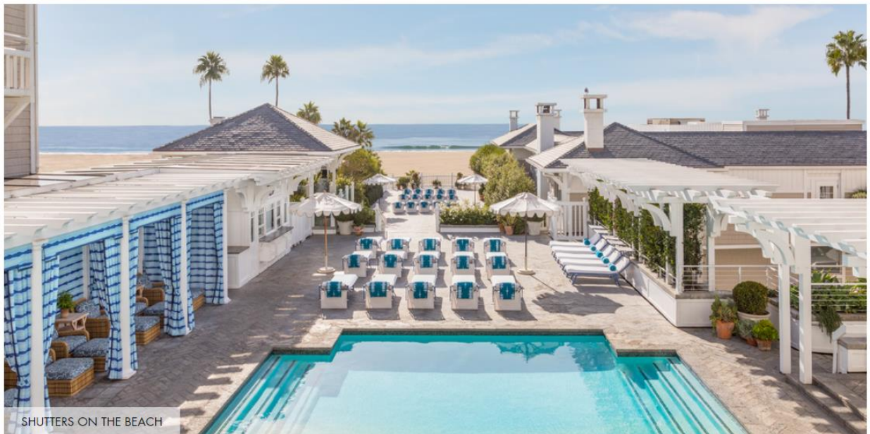
SHUTTERS ON THE BEACH