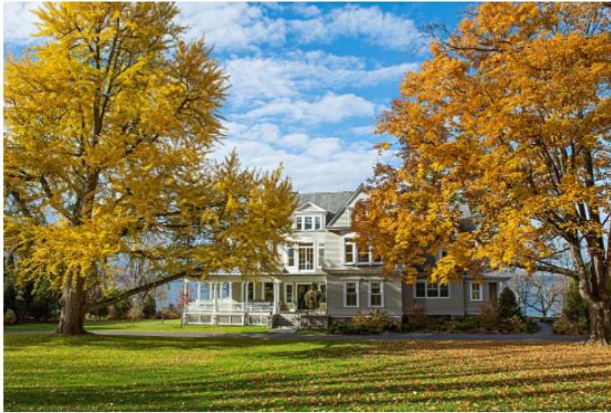
INNS OF AURORA