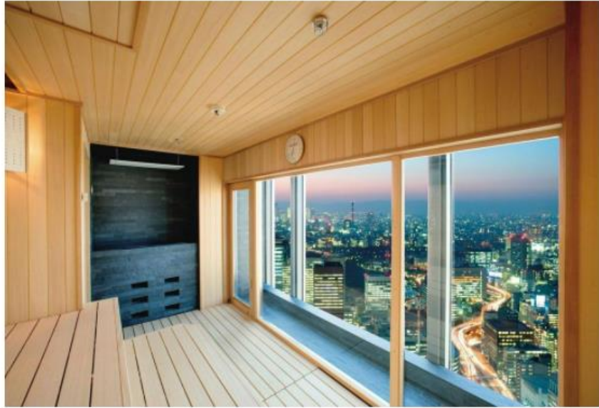
MANDARIN ORIENTAL TOKYO