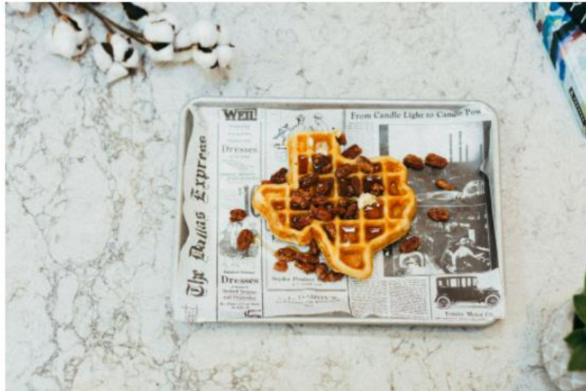
THE BEEMAN HOTEL